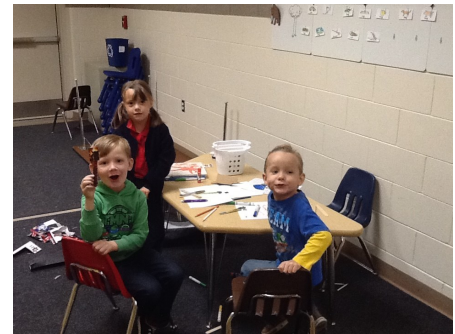
Right: Members of the Star Wars club make puppets of their favorite characters