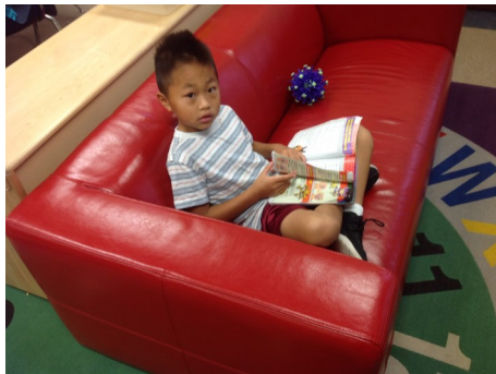
Left: Daily DEAR time (Drop Everything And Read)