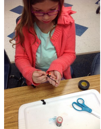
A student uses a battery and electrical tape to create a closed circuit, illuminating a small light bulb!

We're ready for flurries of new activities in December!