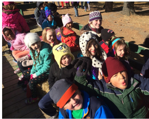
On the hayride!

We had a great October at Minneapolis Kids! The non-school days we combined with Barton kids and went to Airmaxx, the Science Museum of Minnesota, and Minnetonka Orchards to learn about pumpkins, go on hay rides and play on their hay mountain! We had a wonderful time on all 3 field trips.